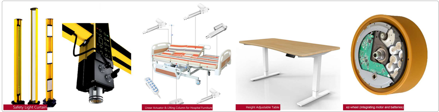
Safety Light Curtain