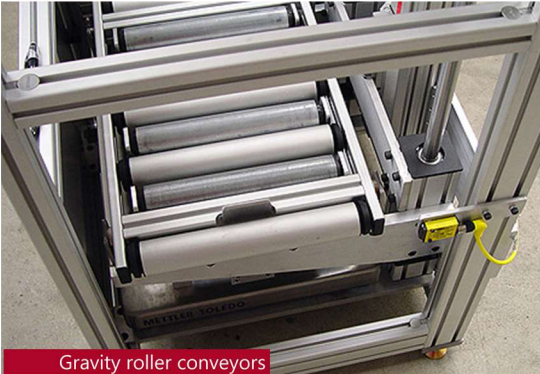
Gravity roller conveyors