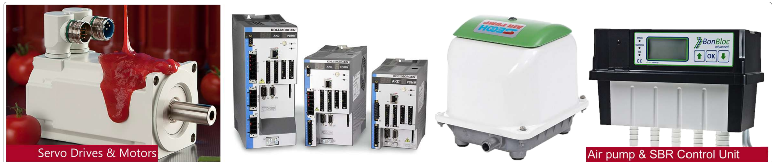
Servo Drives & Motors