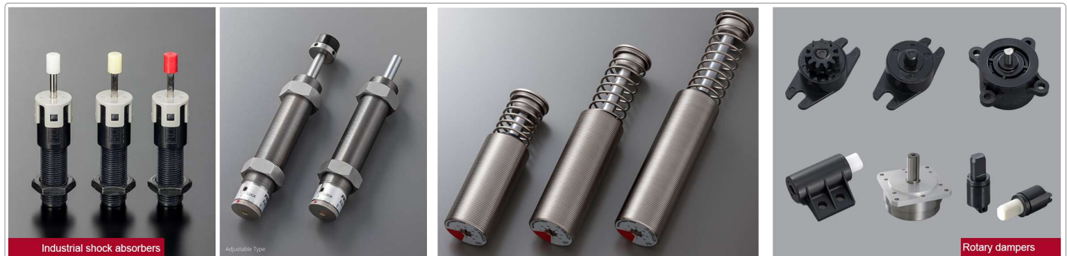
Industrial shock absorbers