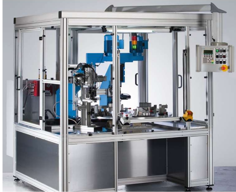
Machine frame & Housing