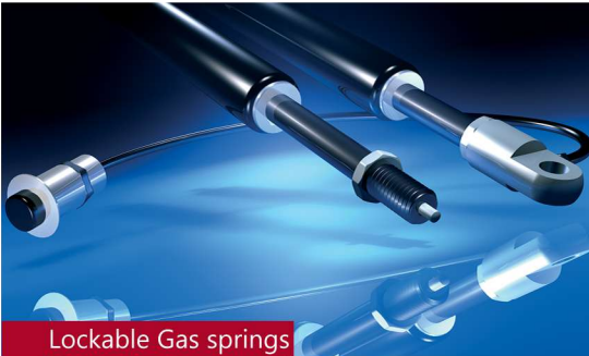
Lockable Gas springs