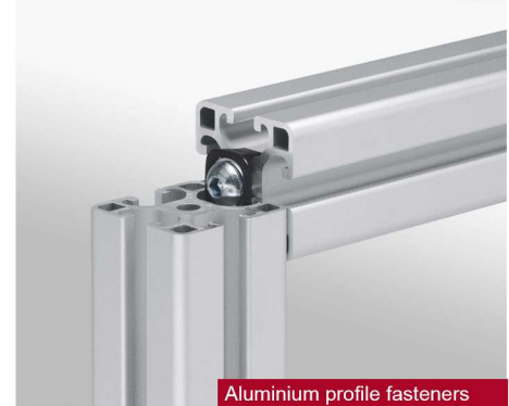
Aluminium profile fasteners