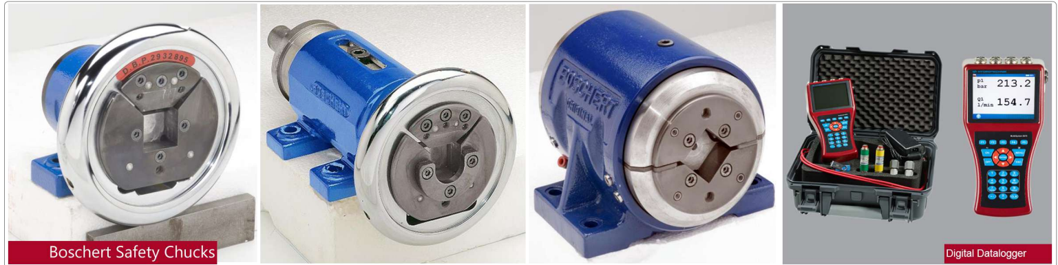
Boschert Safety Chucks