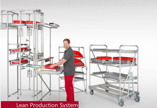
Lean Production System